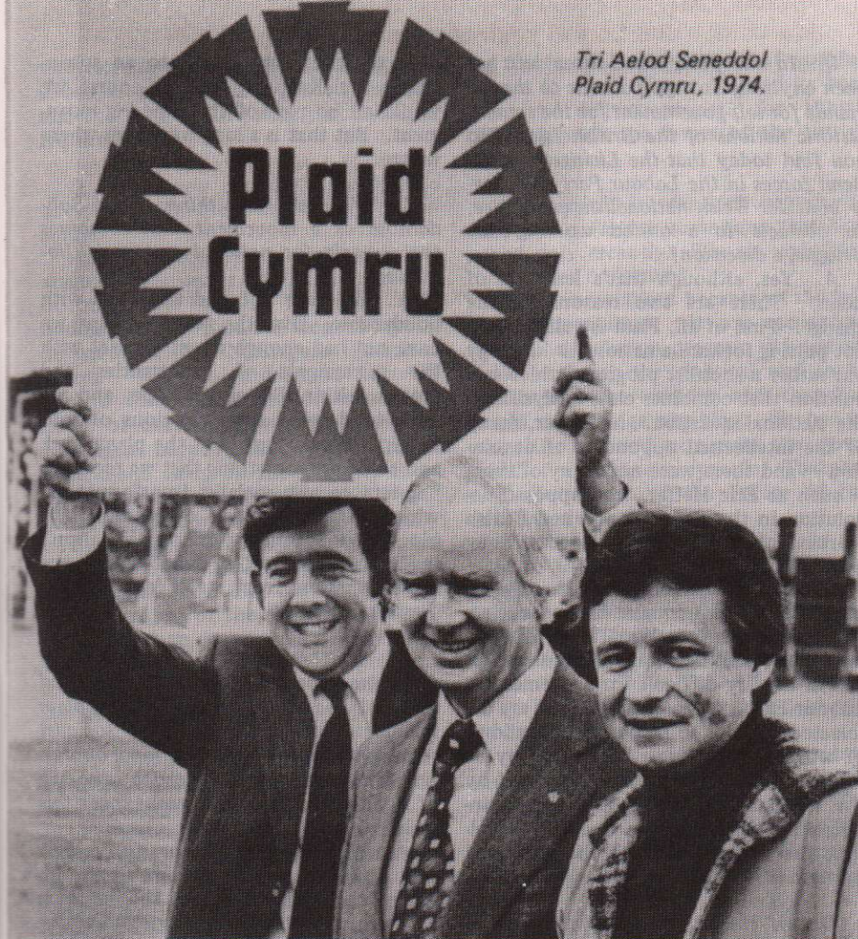
Three Plaid Cymru MPs in 1974

Q. What sort of program does Plaid have for the unions and where does the miners' strike fit into that?