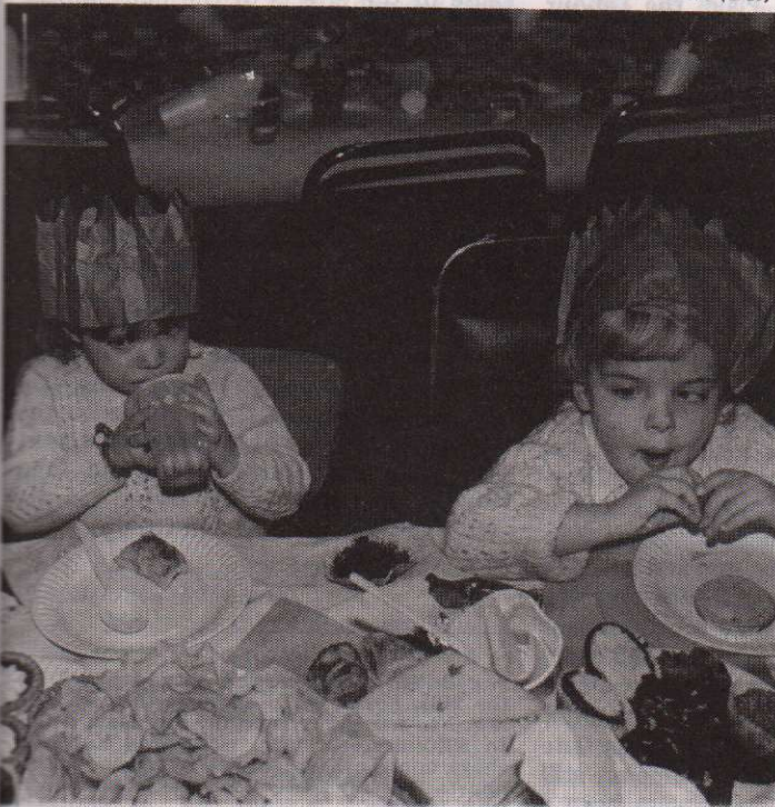
Miners' children at Christmas

In Luxembourg ...the following statement appeared recently in all the major newspapers in support of the National Union of Mineworkers.