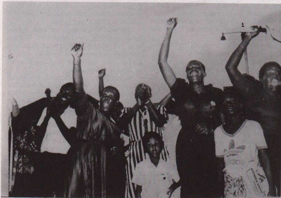
People outside the meeting of October 19, 1984

For similar reasons Gairy faced opposition from the US authorities themselves. US officials hinted that the 57 million dollar aid package to the island would be suspended if Gairy won and a US industrialist who had begun to set up production in Grenada threatened to