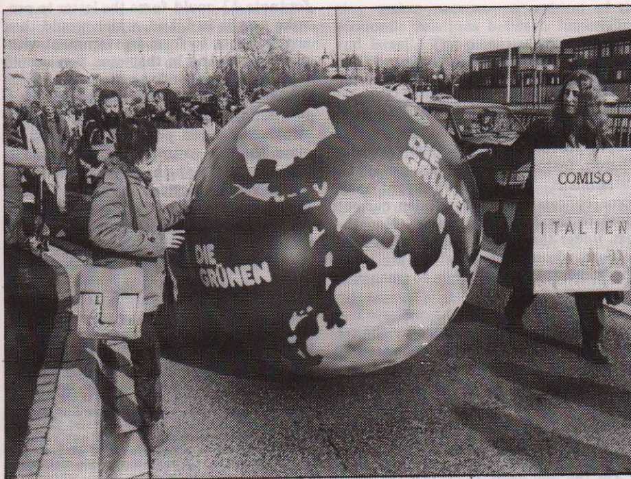
A Greens' demonstration (DR)

The debate over this will be prolonged. It must involve all forces that are looking not for some "neoreformism" but for a social alternative. ■