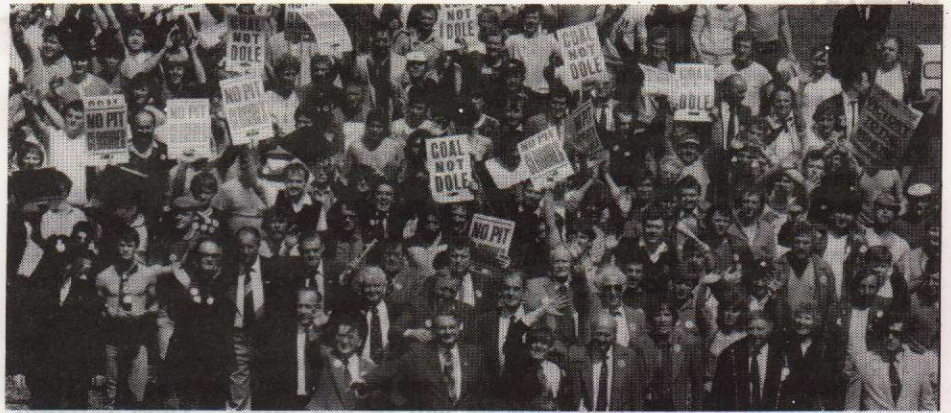
Miners and their wives demonstrate for jobs