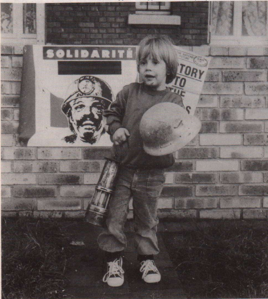
Picture from the French CGT's Christmas appeal to support the miners

AS. Fantastic. Because we're in Kent we've received a lot of the international supporters. The CGT in France came over with a convoy. We've had meetings here with Turkish, Nicaraguan, Zimbabwian and other European visitors. It appears that in Belgium they're stopping the shipment of coal. That's the sort of action we need. ■