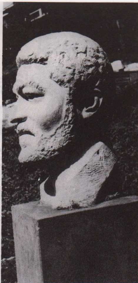
A bust of Maurice Bishop unveiled on October 19, 1984

Many former Bishop supporters voted for the NNP to keep Gairy out. Given the obstacles put in their way and the