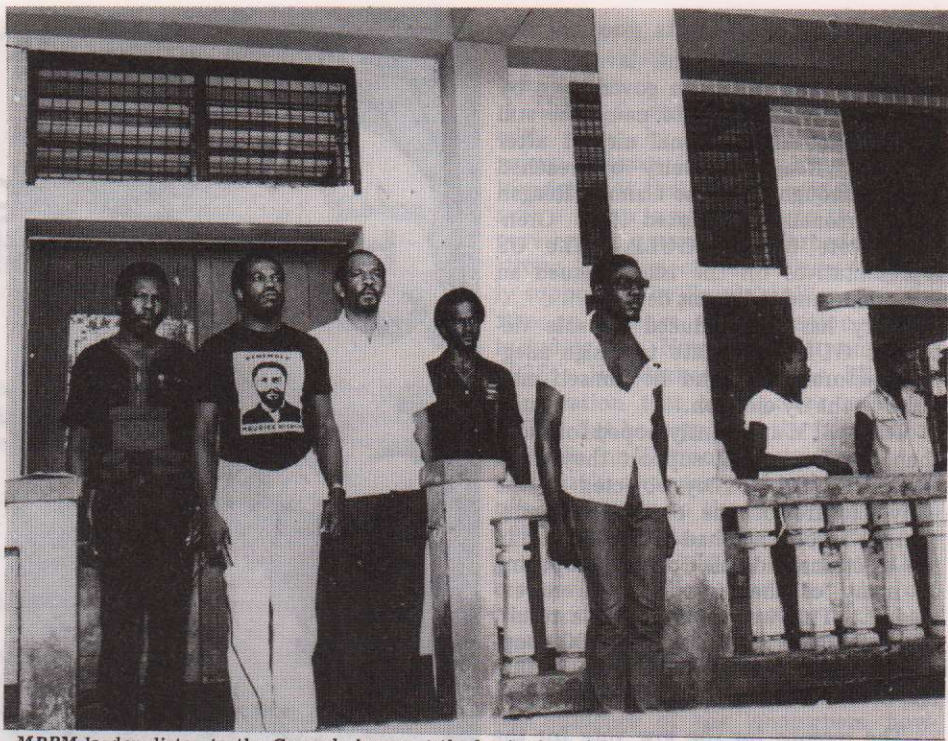
MBPM leaders listen to the Grenada hymn at the beginning of October 19, 1984 meeting (DR)

This consideration was perhaps even more important in the Grenadan context given the relatively lower level of mobilisation of the masses before the March 1979 revolution. Such considerations also apply to the question of the freedom of the press. The type of debate conducted between La Prensa , the bourgeois paper in Nicaragua, and the pro-Sandinista press, has likewise aided the process of mass politicisation and education rather than retarding it. The way in which the FSLN have handled this problem contrasts to the way in which Torchlight , the mouthpiece of bourgeois op-